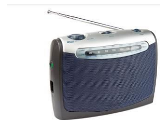
On the radio