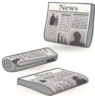
In a newspaper