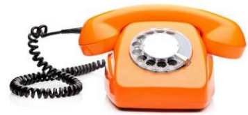
Over the phone