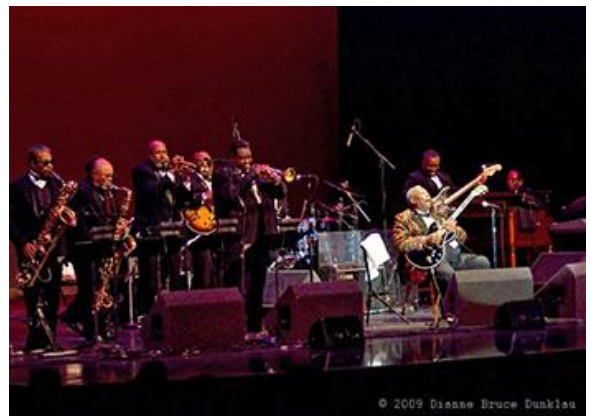
BB King (2011)

What instruments are popular for playing blues now?